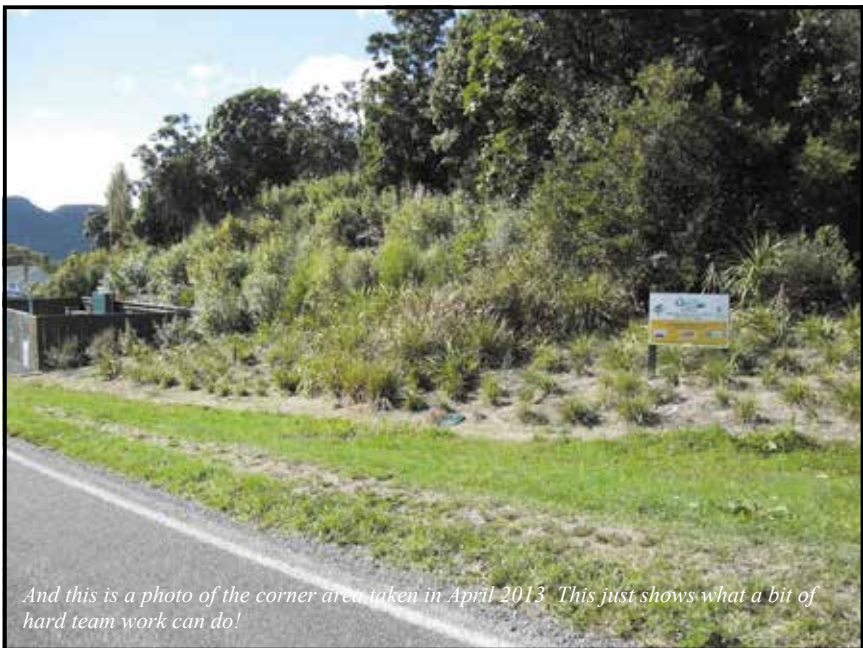
And this is a photo of the corner area taken in April 2013. This just shows what a bit of hard team work can do!