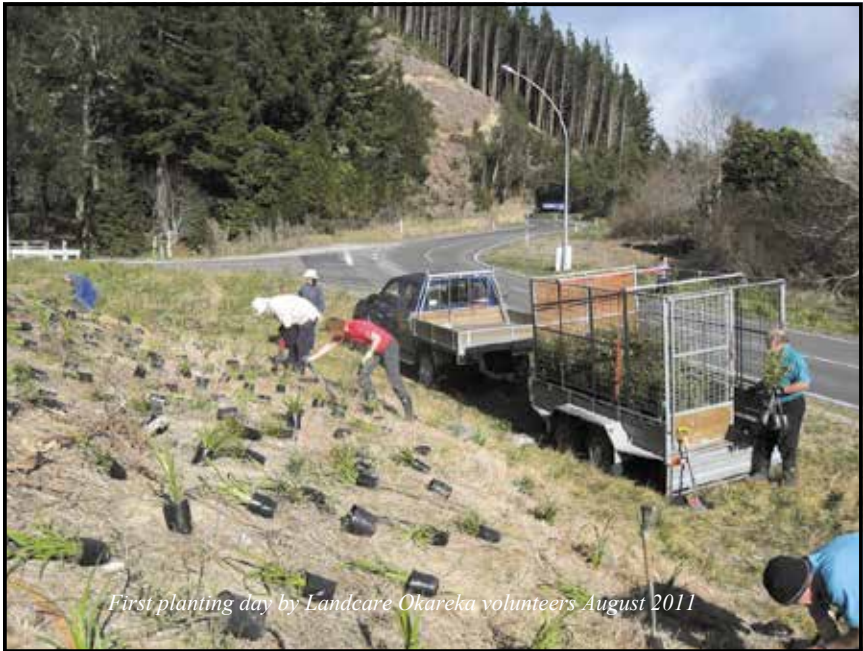
First planting day by Landcare Okareka volunteers August 2011